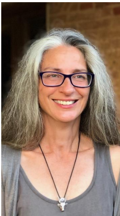
Me on holiday in Italy in 2019!

I grew up in the East End of London before moving to Essex and Epping Forest where I discovered trees. After a school trip to the mountains, I moved to Wales, initially to Swansea where I discovered the sea and studied for a Bachelor's Degree in Psychology. I then embarked on a Masters' Degree in Industrial Relations. These two chunks of my education helped me dive more into the questions, 'How to Live?' and 'What is (the) Work?' both of which have travelled with me throughout my life - to date, 60 times around the sun.