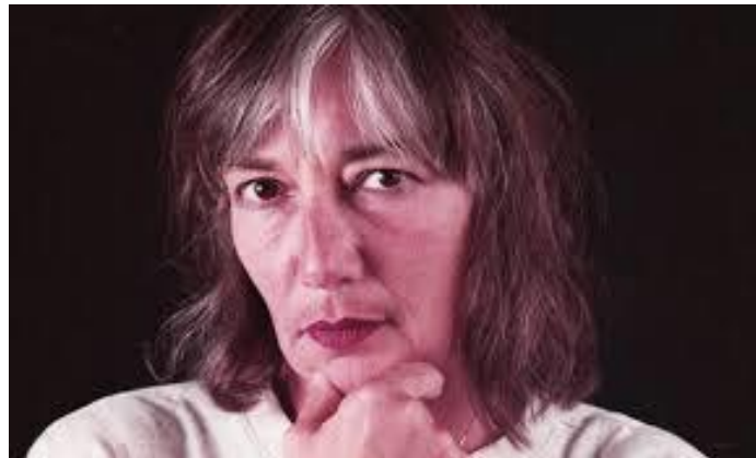
Art Critic, Commentator and Writer Suzi Gablik

This shift of thinking underpinned her book Has Modernism Failed? (1984). The work's heretical views made Suzi many enemies in the art world, but also a swathe of allies.