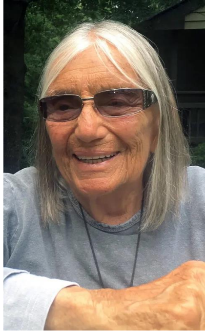
At Home with Suzi Gablik 2017

https://www.theguardian.com/artanddesign/2022/sep/30/suzi-gablik-obituary