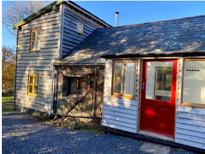
The Barn at The Centre for Emergence