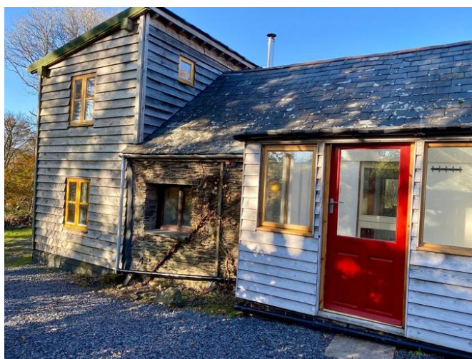
The Barn at The Centre for Emergence

We will have time each day at Y Ganolfan in Aberhosan, a beautiful building which was built as the local village school over 100 years ago. This gives us a larger venue for movement, sound and ritual practise as well as a large kitchen for preparing food and feasting.