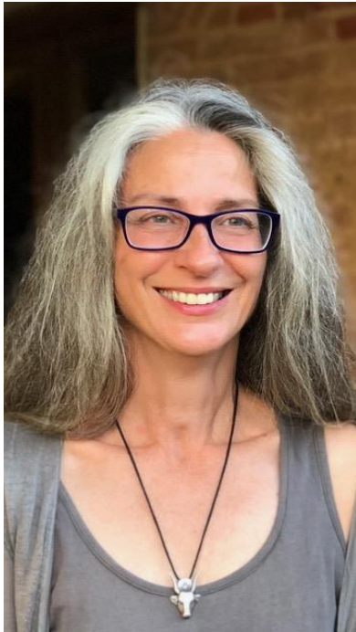
Me on holiday in Italy in 2019!