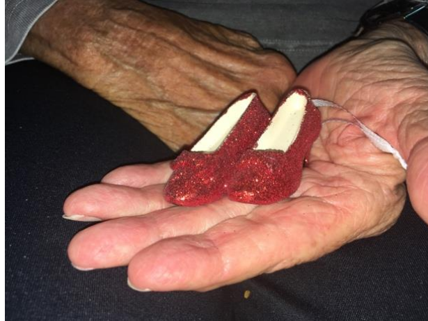
Suzi Gablik's Red Shoes